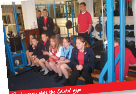
The Hornets visit the Saints' gym

Haydock Hornets want to thank Saints and St Helens EAZ for all of their help with the project so far. We're looking forward to lots more exciting events in the future so watch out for us buzzing about!